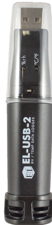
Product code: EL-USB-2